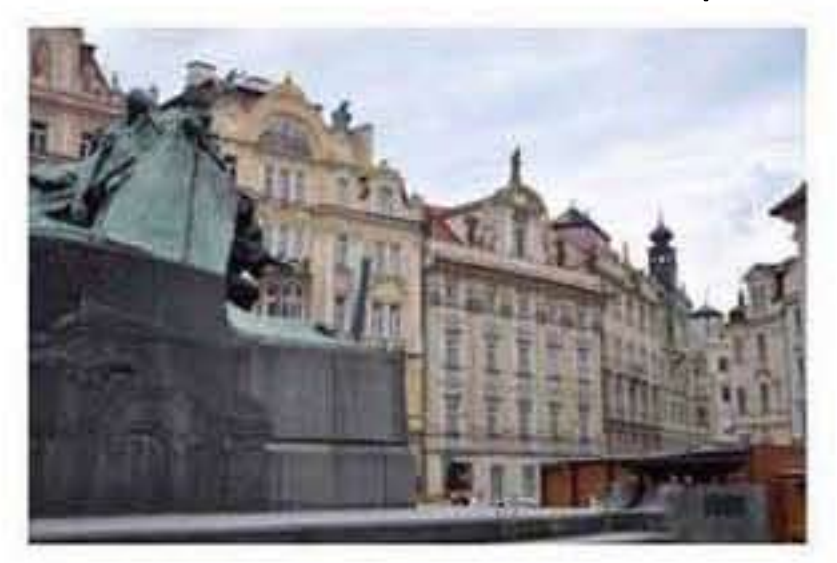
3. Walk around the statue to the right side