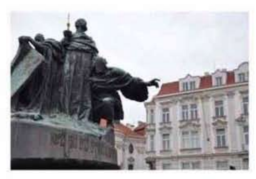
2. Go around the statue