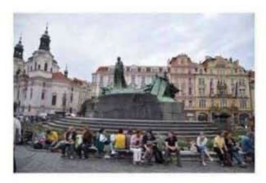
1. Locate the statue in the middle of the square

Old Town Square is about 5 minutes walk from metro station "Staroměstská" on the green "A" line, or from "Náměstí republiky" on the yellow "B" line.