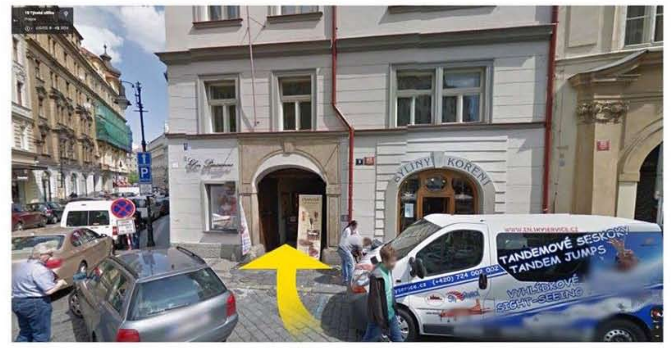
5. In a moment you should come to this building, (Dlouhá str. 6) with our Skydiving Van usually parked in front. Walk inside the passage.