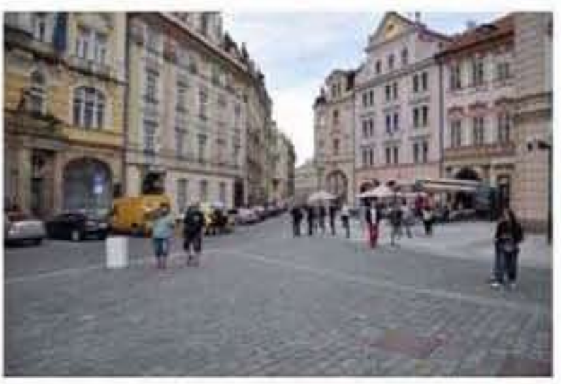
4. You wil get on the street named "Dlouhá", continue down this street about 50 meters